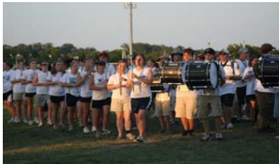
Silver Jaguar Bands